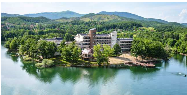
Figure 1 Caption of the figure should be placed below the figure (TNR, 11 pt, italic, centered)

Figures (graphs, photos, maps, etc.) should be of high quality, suitable for reproduction and print (300 dpi or more if possible).